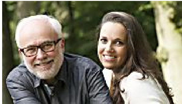
21 Duggar Family... Promoted by WomensForum